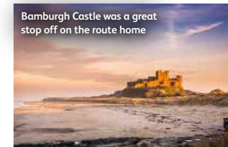
Bamburgh Castle was a great stop off on the route home

We enjoyed another delicious breakfast before our departure, Stuart having smoked haddock with a poached egg while I enjoyed fresh pastries. On our way home, we stopped at Bamburgh to visit the castle and the immaculate white sandy beach. It was worth the short detour from the A1 as we enjoyed a paddle in the sea.