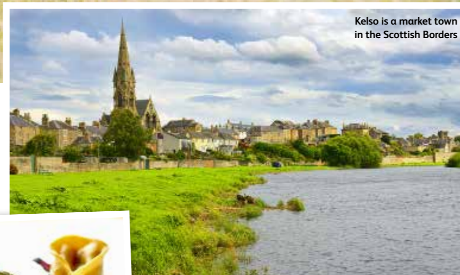
Kelso is a market town in the Scottish Borders