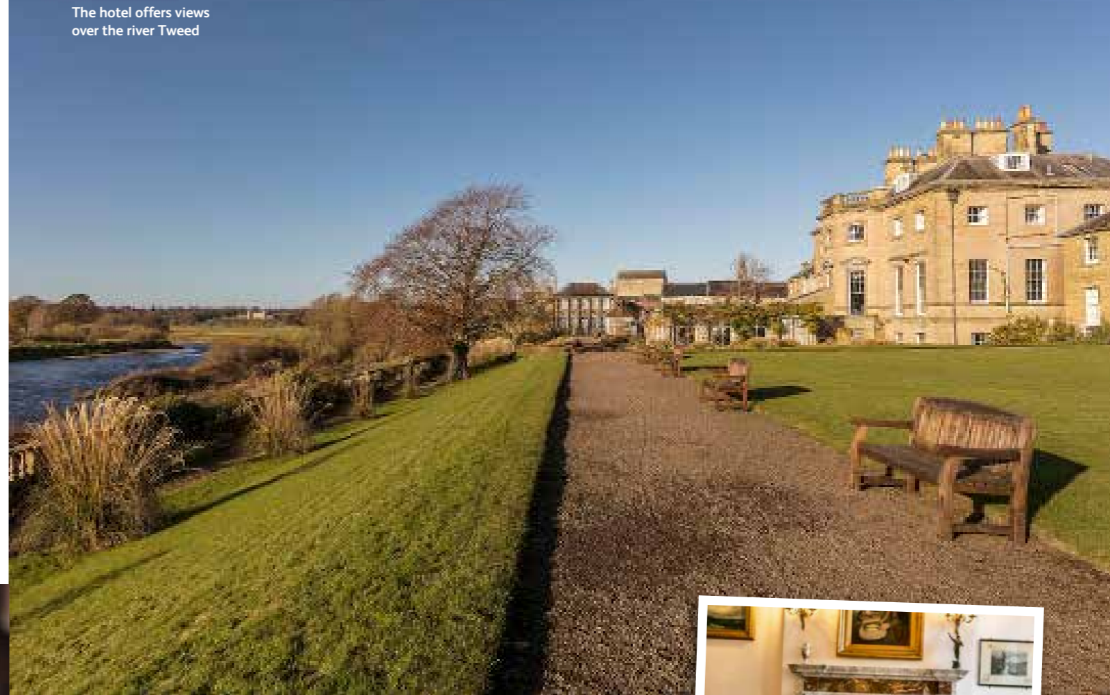
The hotel offers views over the river Tweed

a return visit, dreams of forest adventures and sailing on the reservoir. My wish is to return and see the night sky from Kielder Observatory, and if I am lucky, witness the Northern Lights.