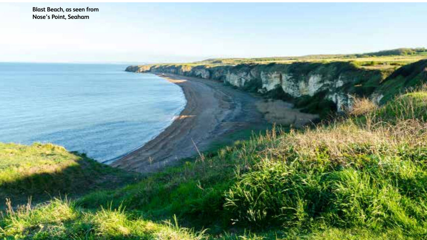
Blast Beach, as seen from Nose's Point, Seaham