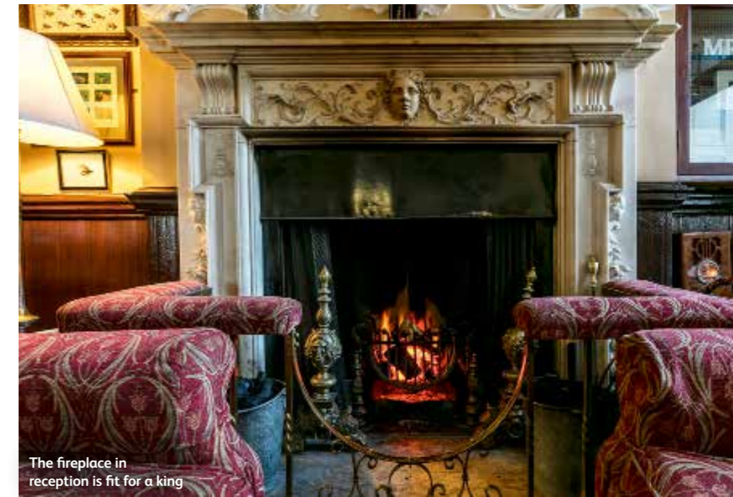
The fireplace in reception is fit for a king